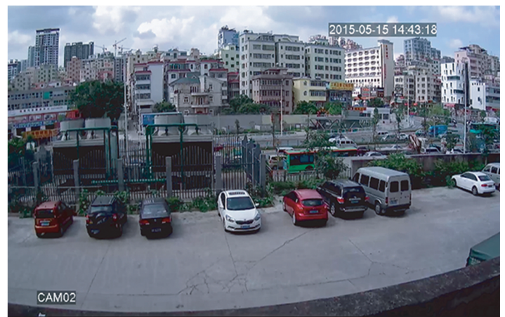
AHD 2.0Mp outdoor in daytime